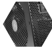
Honeycomb Structure Cable