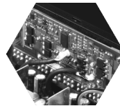
Patented DC connector Module