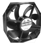
San Ace PWM Silent Fan