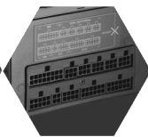
Full Modular Cabling