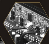
Patented DC connector Module