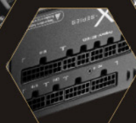
Full Modular Cabling