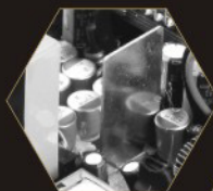
High Quality 105°C Cap