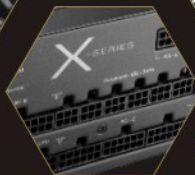
Patented DC connector Module